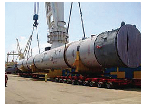
A tandem lift compensates for an off-centre CoG.