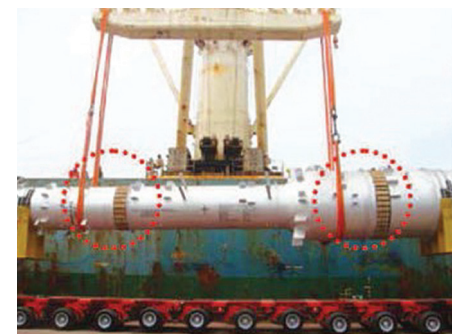
A single crane lifts a column horizontally. The position of the slings here, offset from wooden battens, indicate an off-centre CoG.