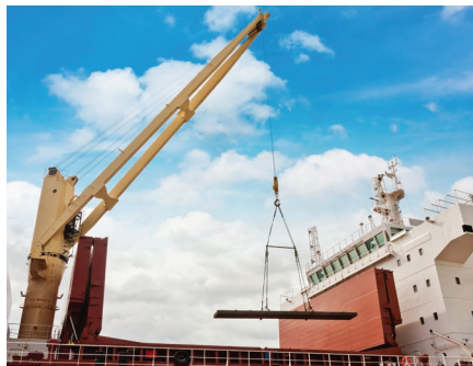
A single, heavy-lift derrick on a cargo vessel poses limitations on the lifting of long columns.

Regardless of whether lifting the oversized cargo involves a single or tandem lift, the usual precautions for a controlled heavy lift should apply.